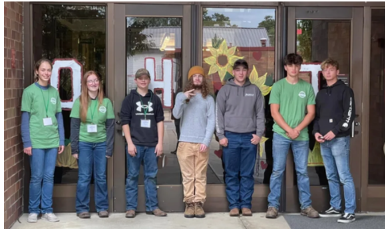
Congratulations to our FFA Nursery and Landscape Team for placing 7th in the Ohio High School Landscape Olympics!