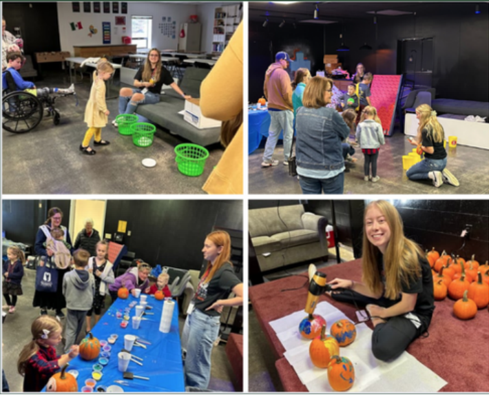
The Ashland High School Sweet Sixteen Dance Team volunteered their time with our local ACCESS program by helping at their Souper Saturday Fall Festival.