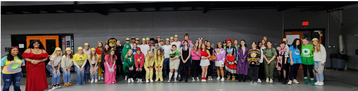
Ashland High School students in our Mentoring & Leadership class, Student Council, and Community Service Club helped with our K-3 District Trick or Treat in October.